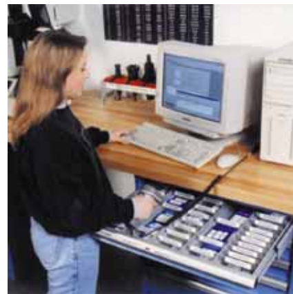
CRIBWARE is optimized for Bar Coding