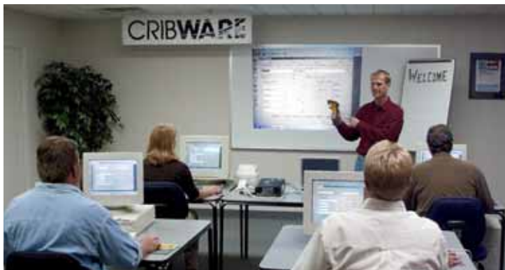
Training assures success

Today, CRIBWARE systems are managing material in a diverse group of industries: aerospace, automotive, consumer goods, contract manufacturing, defense, chemical and petroleum refineries, foundries, industrial machinery, job shops and industrial distribution. Some familiar names include General Motors, Eaton, Babcock and Wilcox, U.S. Navy, U.S. Army, Siemens, NASA, Chrysler, ExxonMobil, Ford Motor Company, Toro, Honda Corporation and Parker Hannifin.